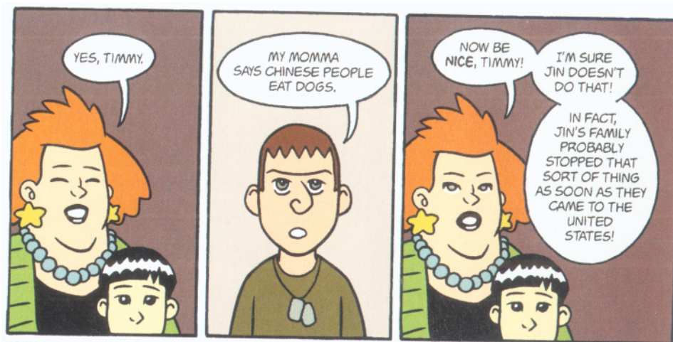
Figure 2. Chinese people don't eat dogs, at least not in America (Yang ABC 31).