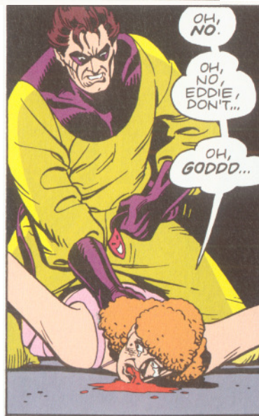
Figure 4. The attempted rape of the original Silk Spectre.

1. Which "traditional" female roles are being fulfilled in these panels?